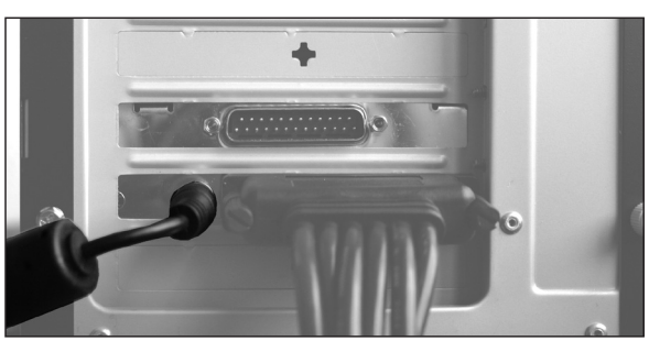
or externally (24V).

3) Connect the positioning unit(s) and any further linear measuring systems (optional accessories) to the preconfigured axes.